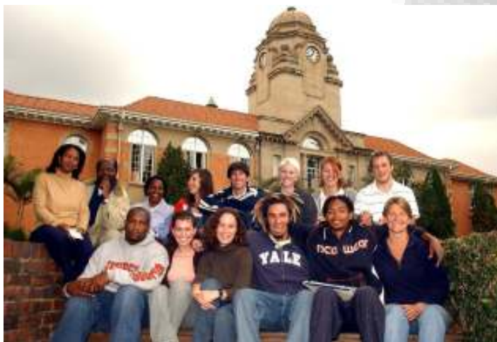
2005 Participants at the University of KwaZulu-Natal, Pietermaritzburg

The 2007 Zulu GPA is scheduled for June 13 through August 05.