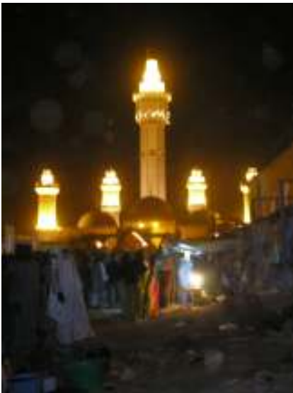
Touba at night

I had many apprehensions. I'm not Muslim and I really don't know anything about this Bamba figure! People are going to think it's bizarre that I came. I will be an outsider. As soon as we arrived, a lively student came over, smiled, and put down an enormous bowl of ceebujën , Senegal's national dish of rice and fish. My happy stomach and the friendly face lifted my spirits.