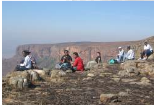
2006 Fulbright-Hays Zulu GPA Participants on Table Mountain (Umkhambathi), near Camperdown, South Africa

The Center's African Language Program continues its efforts to advance knowledge and understanding of Africa and its people by offering a wide array of languages spoken in three major regions of Africa, namely, West, East and Southern Africa. The program aims at integrating its language curriculum into the Center's multidisciplinary courses and research by students and faculty whose interest and focus span the continent. Our pool consists of students interested in fulfilling a language requirement, conducting research in Africa, doing study abroad in Africa, as well as