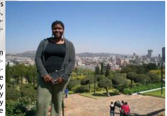
Bernice in KwaZulu-Natal, South Africa

It is my sincere hope that more Penn students leave the comforts and routines we create for ourselves and embark on a journey to learn about the challenges faced by others, a journey you can begin by studying a completely foreign language. As cliché and corny as it might sound, I cannot emphasize enough the importance and need for students to broaden their horizons and embrace communities different from themselves. Perhaps it is just one of things you will only understand when you yourself experience another way of life. I will forever be grateful to the African Studies Center's Language Program at Penn for opening the door of opportunity for me to study Zulu and spend my time here in South Africa.